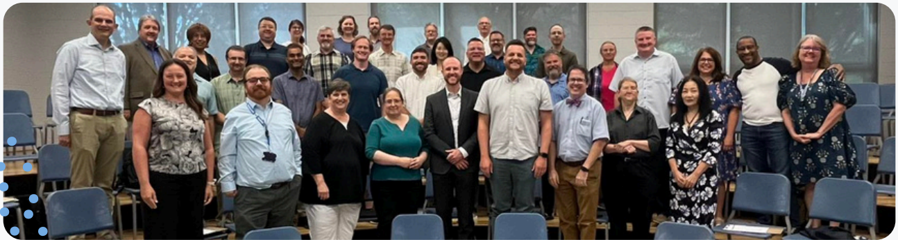
The Music Faculty and Staff held their annual retreat last week in SFA 117.